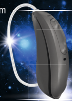
sound ST R312 (battery powered)