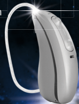
AQ sound ST R (rechargeable)