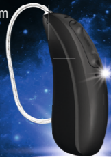
AQ sound ST RT (rechargeable, with telecoil)